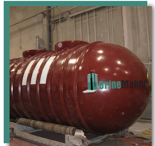
Single & Double Wall

When getting it right the first time is critical, and underground installations always are, you can trust BrineMaker to deliver.