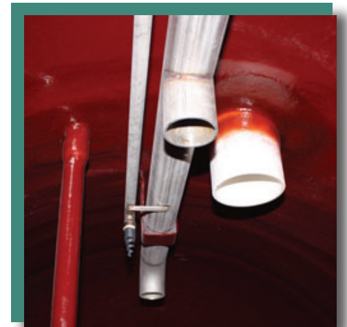
Salt & Water Distribution Headers