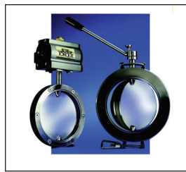
Sanitary Butterfly Valves